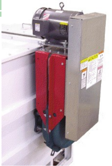
Screw Conveyor Drive for RB-1000 and RB-2000 Mixers