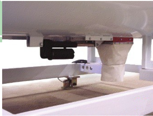
Torque Arm Reducer Drive for RB-4000 and RB-6000 Mixers