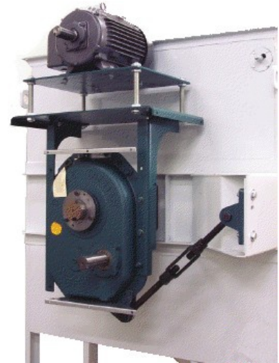
Optional Electric Gate Discharge